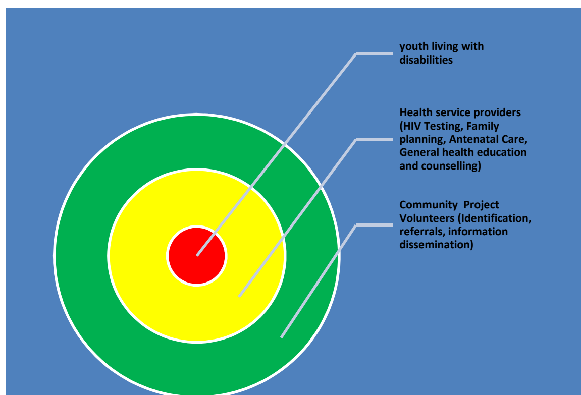
Diagram below shows the cycle of care that has been created in the communities specifically to cater for youth with disabilities.

The table below shows the number of youth with disabilities who have accessed SRH information and services at clinical level. Services ranged from, HIV testing, family planning, Antenatal Care, information on VMMC, Counseling and general medical treatment.